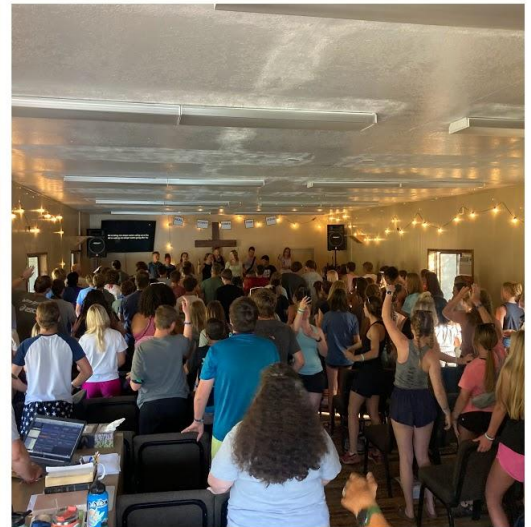
"Making disciples through Bible-based, Christ-centered camping experiences"