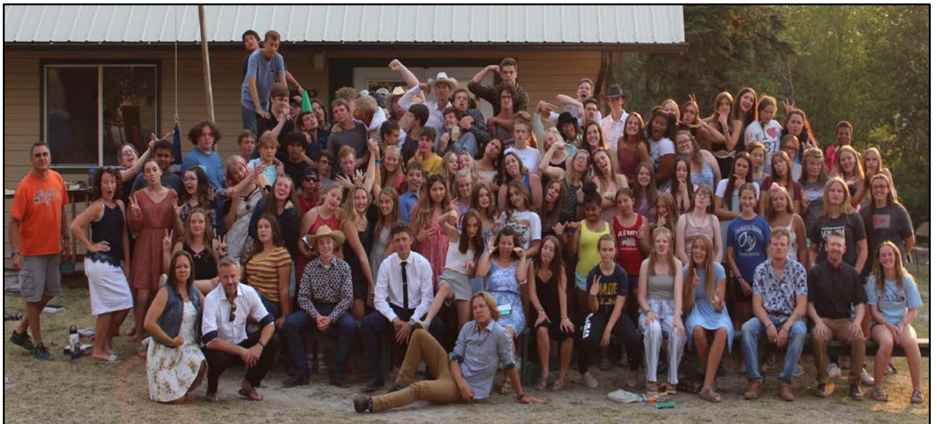
(Above: The 'silly' picture, High School week 1, July 2021)

LOST & FOUND- In their own words, here's a snippet of what campers 'lost' at camp: Shame and guilt, feelings of worthlessness, anger, anxiety, emptiness, broken dreams, lies about who they were, depression and fear. Here's what they said they found: Surrender, trust, confidence, knowing Jesus loves them and has a plan for their lives, a desire to share Him with others and disciple people for Jesus Christ.