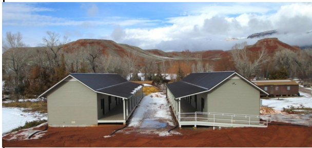
Dorm rooms at ISU Geology Field Station

He is the author of the book series Serving in Hazardous Places .