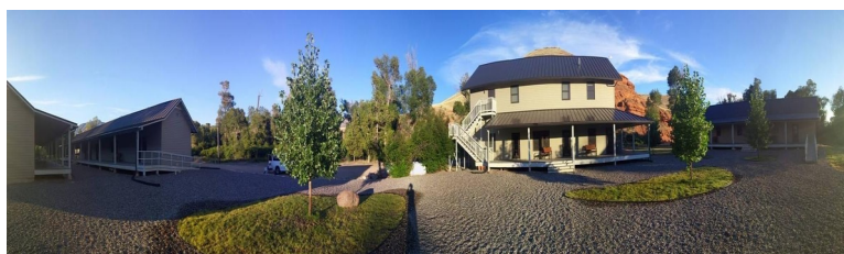
Dorms and the Smith Lodge

Directions: 13 miles east of Greybull, WY on U.S. Highway 14